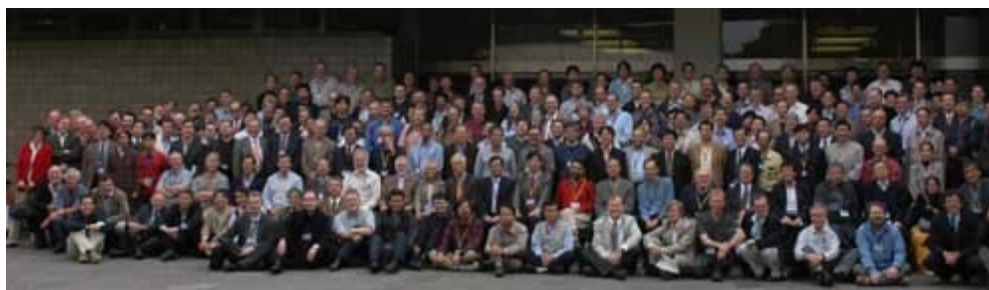
Two hundred and thirty linear collider specialists meet at KEK in Japan.

Over 200 physicists and engineers from Asia, Europe and the Americas, including 21 people from SLAC, met at the KEK High Energy Physics Laboratory in Tsukuba, Japan, to explore rapid development of a conceptual design of the International Linear Collider (ILC).