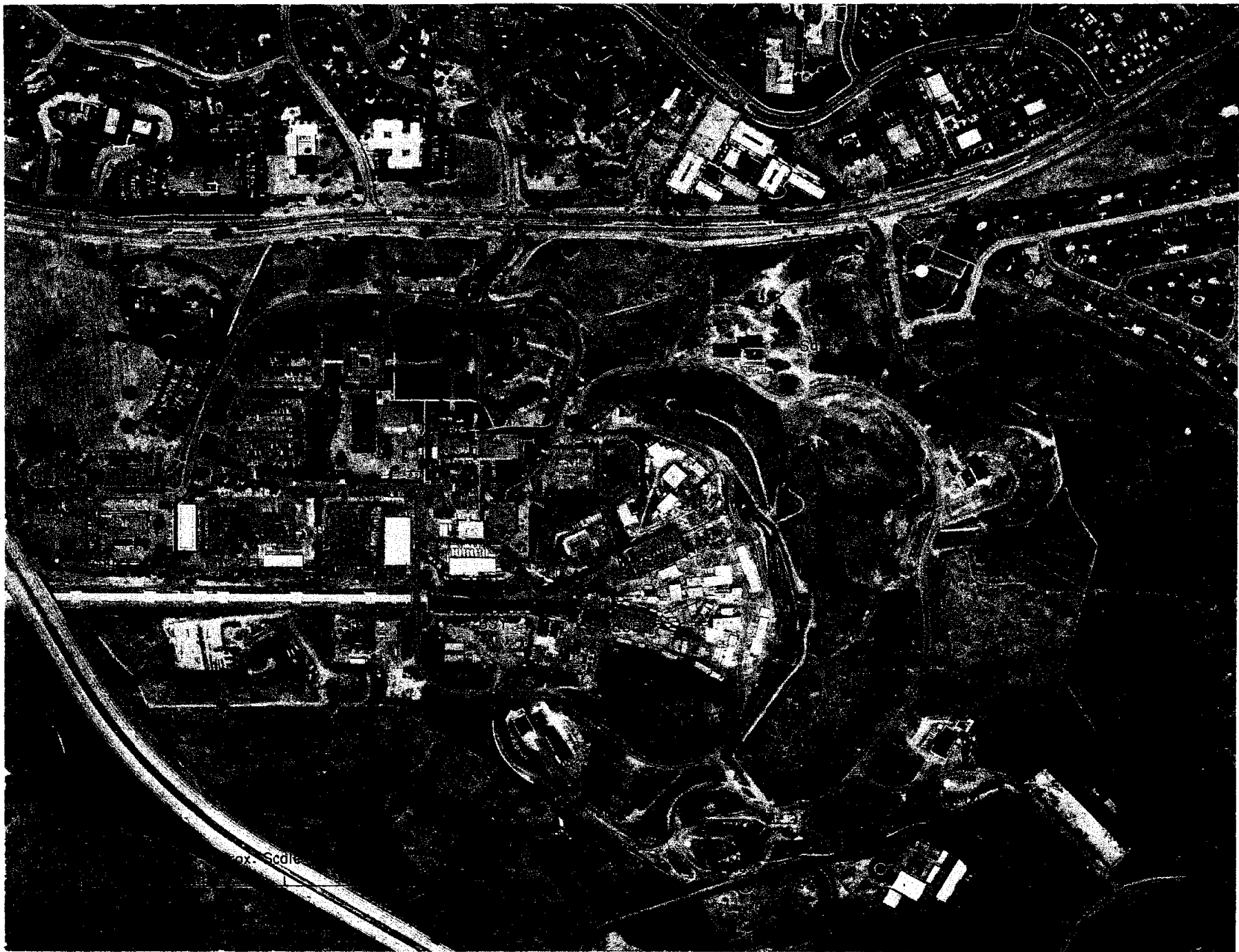
Fig. 3. SLAC research yard and surrounding community.