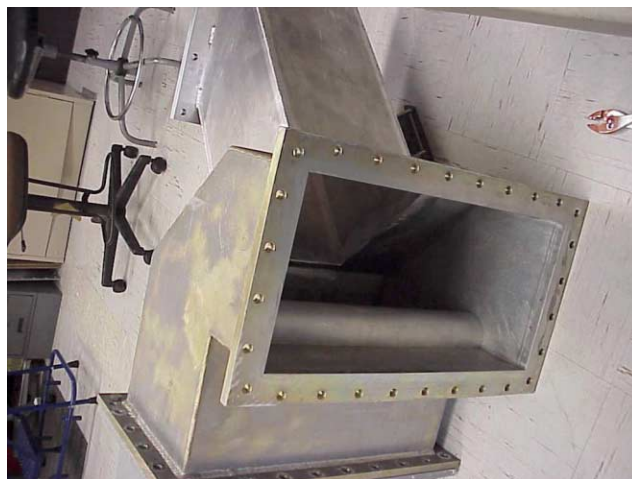
Figure 1: Mitre converted into port for waveguide load. Note the cylindrical pipe welded into the inner broadside corner for matching f_{RF} .

the guide, increasing both the field strengths in the guide and the reflected power seen by the klystron. A capacitive diaphragm provided the necessary compensation for one mitre; a capacitive post matched the other.