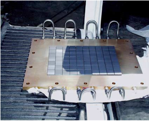
Figure 2: Ferrite tiles brazed on copper plate with cooling lines attached.

was straightforward to obtain reflected power levels such that |S_{11}| < .01 .