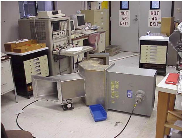
Figure 3: Test setup for adjusting matching for f_{RF} in modified mitre.

was straightforward to obtain reflected power levels such that |S_{11}| < .01 .