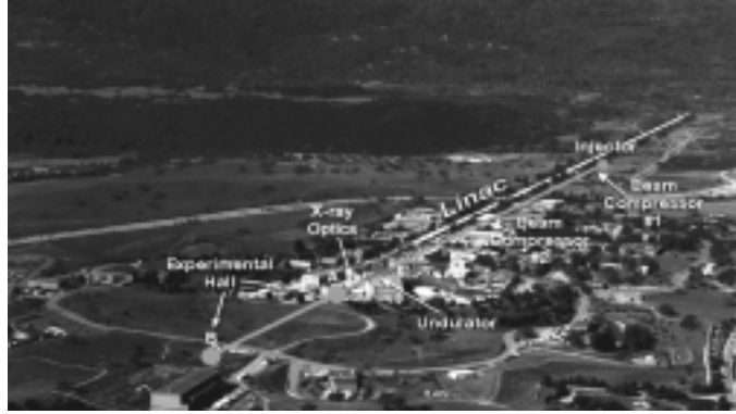
FIG. 1. Photograph of the SLAC site showing proposed placement of the LCLS.