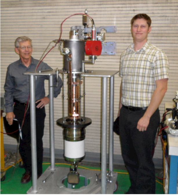
Figure 1. An XL-4 Klystron without solenoid.