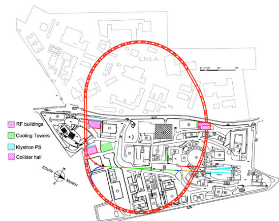
Figure 1: SuperB footprint at LNF.