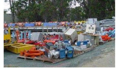
Figure 1: The fate of two-time Nobel prize-winner SPEAR 2.

The 4-year, 58 M$ SPEAR 3 upgrade project, administered by the DOE with ~50% joint funding from NIH, was officially completed on November 15, 2004, when the last vacuum chamber component was installed in the ring tunnel. This date marked the end of a 7-month installation period that completely replaced the tunnel