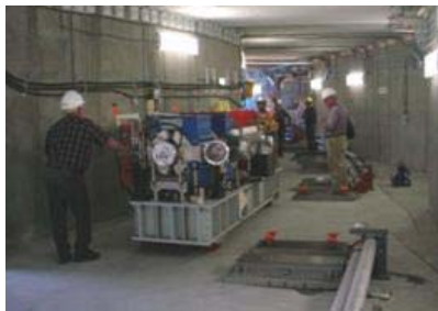
Figure 3: Installation of magnet rafts on new floor in tunnel.

not show any appreciable settling (at the 100- \mu\text{m} level) after its initial cure. Alignment and grouting of the magnet raft support plates were completed a week ahead of schedule.