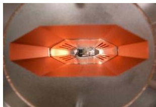
Figure 4: Low-impedance DCCT chamber.