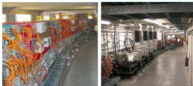
Figure 5: Installed magnet rafts and RF cavities.