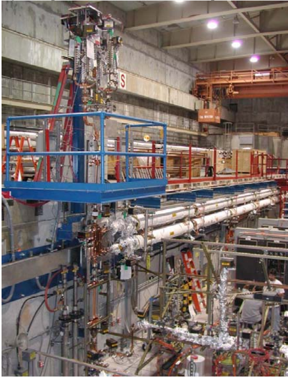
Figure 2: The 8-Pack system, showing the SLED delay lines (white) attached to the copper over-height SLED head, and the high power loads above. The klystrons are in the lower right.

The klystron power is combined in pairs in single-moded WR90 wave guide and transported to the SLED-II pulse compression system. Here the power from the two klystron pairs is combined and manipulated in over-