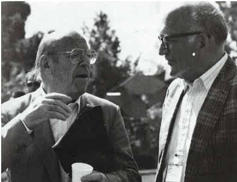
Wolfgang Paul and Sid Drell