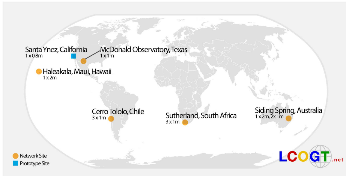
Figure 1: The 2x2m and 9x1m telescopes making up the deployed LCOGT network, as of January 2014.

This level of automation is the enabler for the key feature of the network - its global scheduling. The control metaphor for the LCOGT network is that of a single global instrument, capable of observing an unusually large area of sky, and, for southern targets, almost always in darkness, so unfettered by the diurnal cycle. The network is homogeneous; within each telescope class, the telescopes are exact clones, with identical build, instrumentation and filters. Both spectra and CCD imaging may be performed from any site.