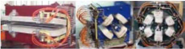
Figure 1: Gradient dipole, quadrupole and sextupole magnets received at SLAC from IHEP, Beijing.

The SPEAR 3 magnet lattice has 36 C-shape gradient dipoles ( k = -0.33 \text{ m}^{-2} ), 94 Collins-type quadrupoles, 72 closed-yoke sextupoles, 54 horizontal and 54 vertical combined function dipole correctors ( \pm 1.5 mrad horizontal and \pm 0.75 mrad vertical). The magnet cores are made with AISI 1010 steel laminations with chamfered ends to improve integrated field quality. The complete magnets are being fabricated by IHEP in Beijing which has so far completed \sim 20 dipoles, \sim 40 quadrupoles and \sim 10 sextupoles (Figure 1), all of which meet or exceed field quality specifications. A 1.13-m Lambertson septum magnet with 8.79^\circ vertical bend and 5-mm septum aperture is in the final design phase.