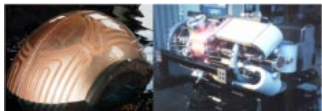
Figure 3: Electroforming copper over RF cavity water-cooling passages (left), and a complete cavity assembly.

The 90-kV, 27-A high voltage supply will be identical to those used for PEP-II. The supply has a SLAC-designed SCR voltage control. The digital EPICS-based PEP-II low-level rf control system [6] is being assembled.