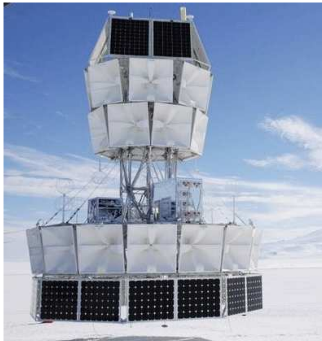
Figure 1. The ANITA payload just prior to launch in late 2006.

A photograph of the ANITA payload shortly before launch is shown in Fig. 1. The primary radio sensors are 32 ultra-broadband, dual-linear-polarization, quad-ridged horn antennas with a field of view