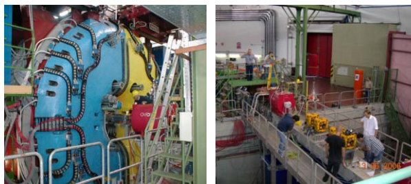
Figure 2: DAΦNE IR1 before and after KLOE roll-out.

The KLOE detector has been displaced from the beam line for the first time since spring 1999 when it was rolled in IR1 to begin its physics enterprise. The detector is now parked in a dedicated hall separated from the DAΦNE one by a dismountable concrete-block wall. It will undergo some maintenance, while future data taking runs are not planned yet. A new vacuum chamber has been installed in IR1 to replace the KLOE one, equipped with 4 electromagnetic quadrupoles allowing a flexible optics and an easy separation of the beams in IR1. Pictures of IR1 before and after KLOE roll out are shown in Fig. 2.