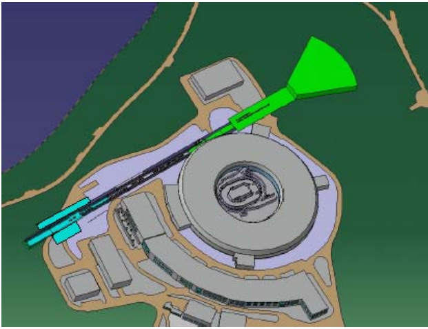
Figure 1: The FERMI FEL facility shown adjacent to the existing synchrotron radiation source Elettra.

Figure 2 shows the machine layout with various sections identified; INJ – injector, L1-L4 – linac sections, BC1,2 – bunch compressors, MTC1,2 – matching section, RAMP – vertical transport line, SPRD – beam spreader section, FEL1,2 – FEL's.