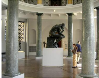
Cantor Museum & Rodin Garden